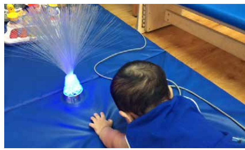
Photos: Hacienda staff with Phoenix Sun Charities check presentation (top), a child (resident) playing with sensory toys purchased with the grant money (bottom photos).