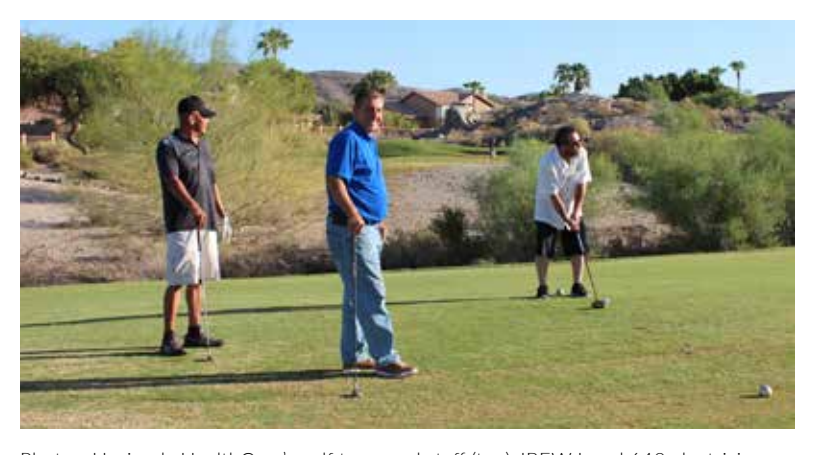
Photos: Hacienda HealthCare's golf team and staff (top), IBEW Local 640 electricians, contractors and members (middle and bottom).