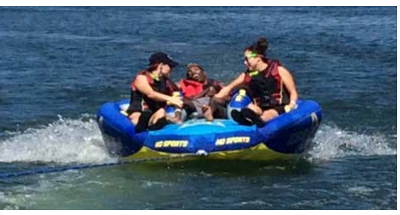
Hacienda Skilled Nursing Facility's residents enjoying the Day at the Lake.